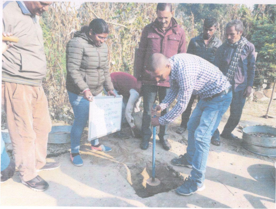
Density test of Sub-Grade at Km- 0/050