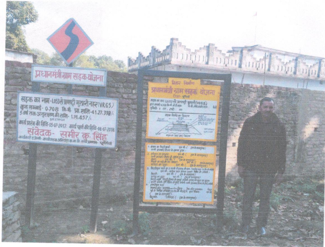
Main information Logo Board, board at km -0/00