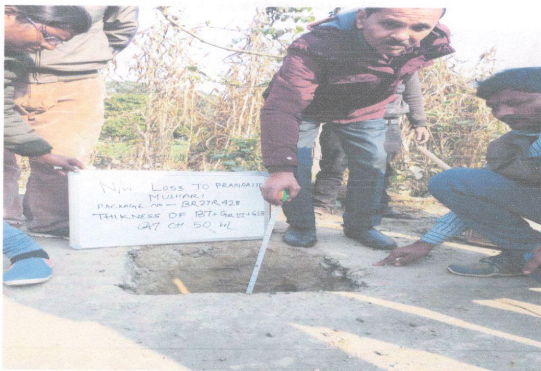
THICKNESS OF B.T + WBM GR-3 + GSB AT CH – 0/050 KM