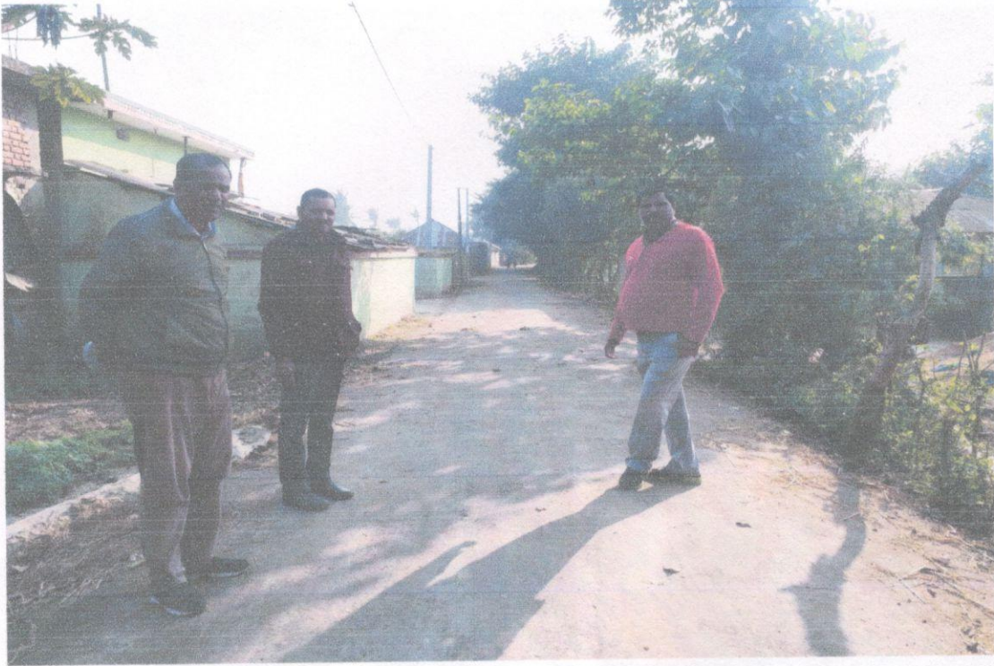
GENREAL VIEW OF THE ROAD AT CH – 0/400

Bihar Rural Road Development Agency Project Implement unit PURNIA, Dist- Purnea Name of Road:- L053 TO PRANPATTI TO MUSHARI Block-K. NAGAR PKG- BR27R 428 Length – 0.708KM