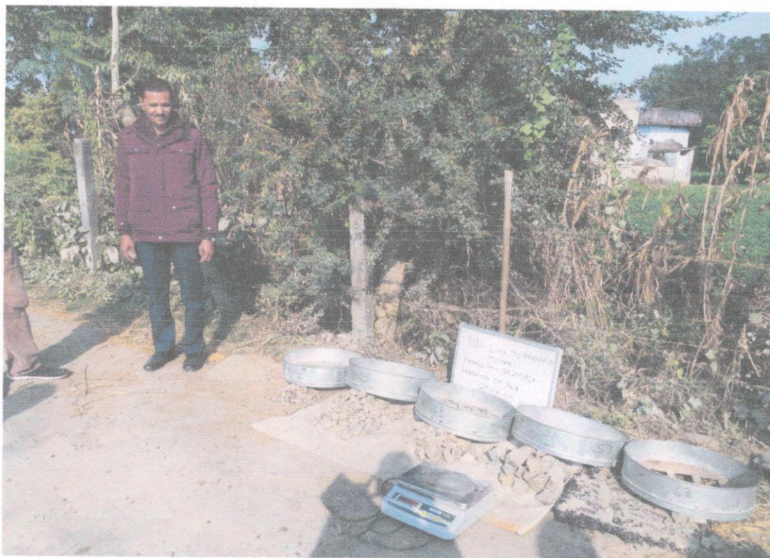
Gradation Test WBM G-3 at KM- 0/050

Bihar Rural Road Development Agency Project Implement unit PURNIA, Dist- Purnea Name of Road:- L053 TO PRANPATTI TO MUSHARI Block-K. NAGAR PKG- BR27R 428 Length – 0.708KM