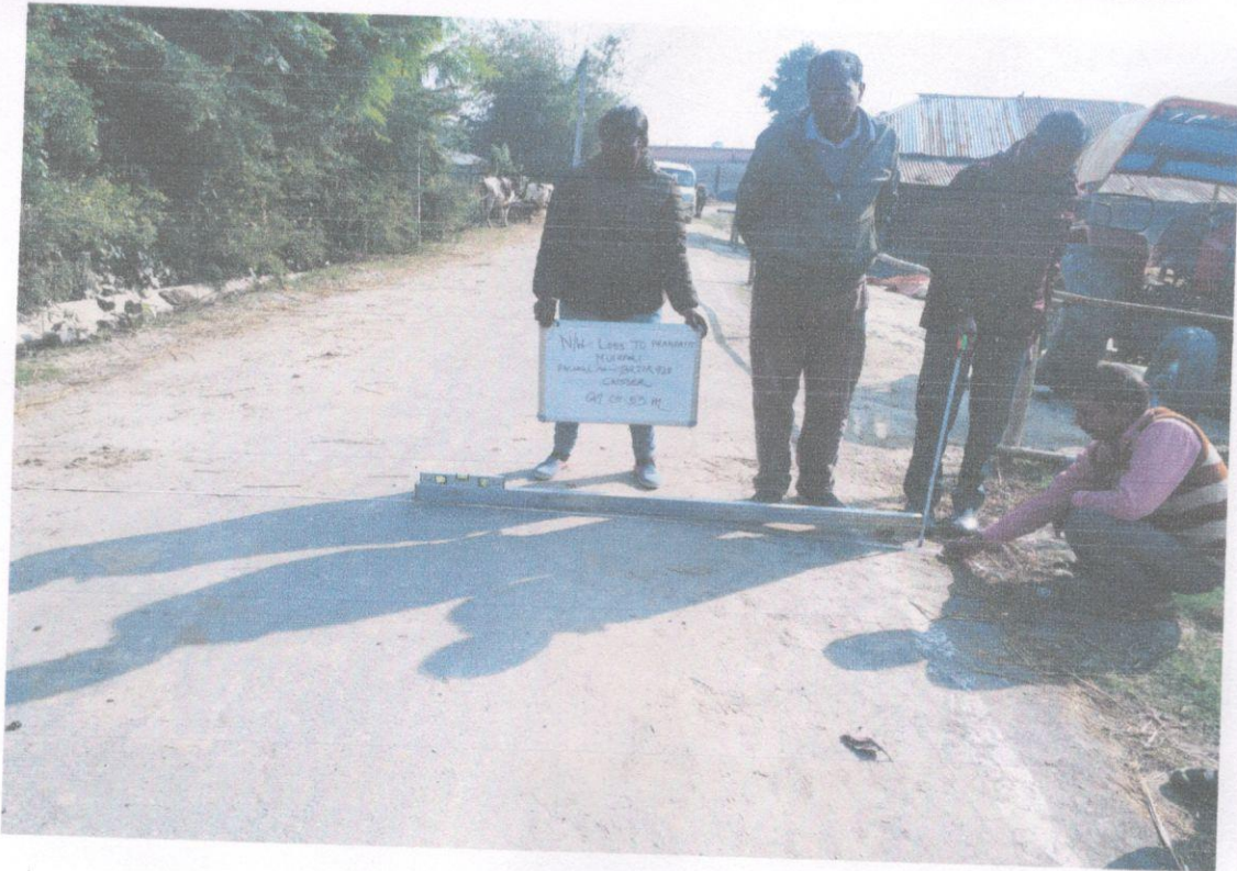
Camber at KM-0/050

Bihar Rural Road Development Agency Project Implement unit PURNIA, Dist- Purnea Name of Road:- L053 TO PRANPATTI TO MUSHARI Block-K. NAGAR PKG- BR27R 428 Length - 0.708KM