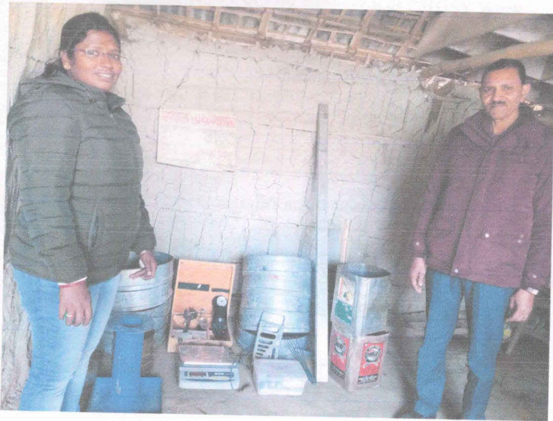
LAB Equipments AT CH – 0/030

Bihar Rural Road Development Agency Project Implement unit PURNIA, Dist- Purnea Name of Road:- L053 TO PRANPATTI TO MUSHARI Block-K. NAGAR PKG- BR27R 428 Length – 0.708KM