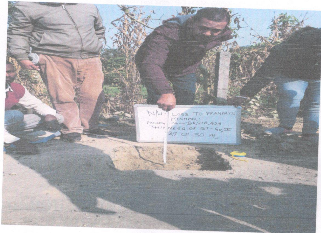
THICKNESS OF B.T + WBM GR-3 AT CH - 0/300 KM