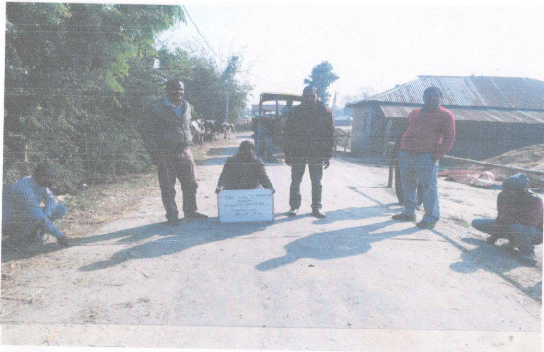
Carriageway at KM-0/050