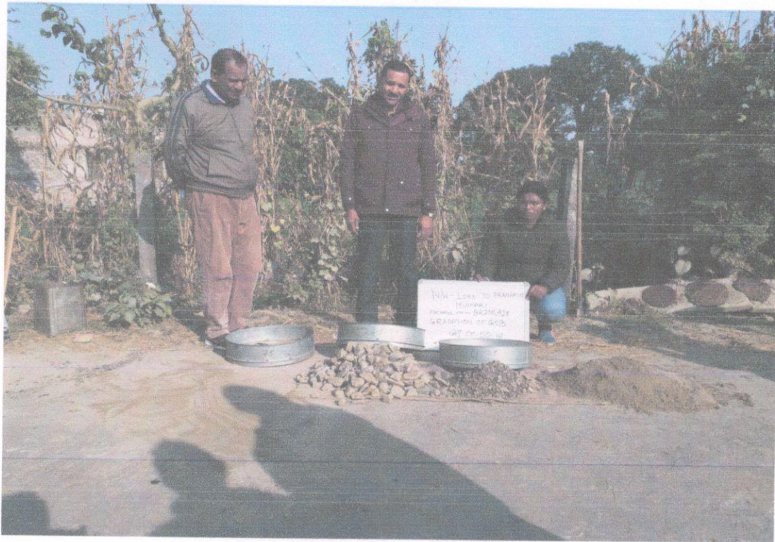
Gradation test of GSB at KM-0/050