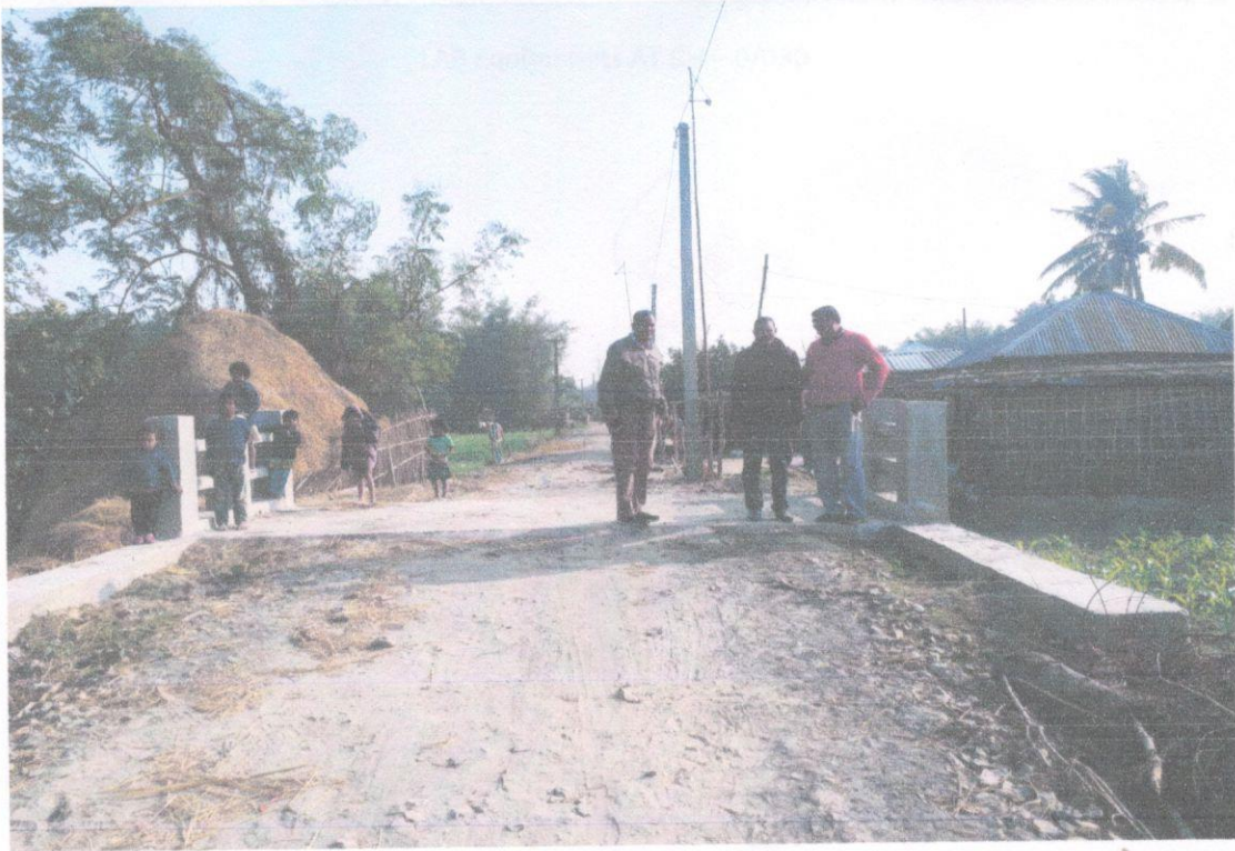
CD at KM-0/650