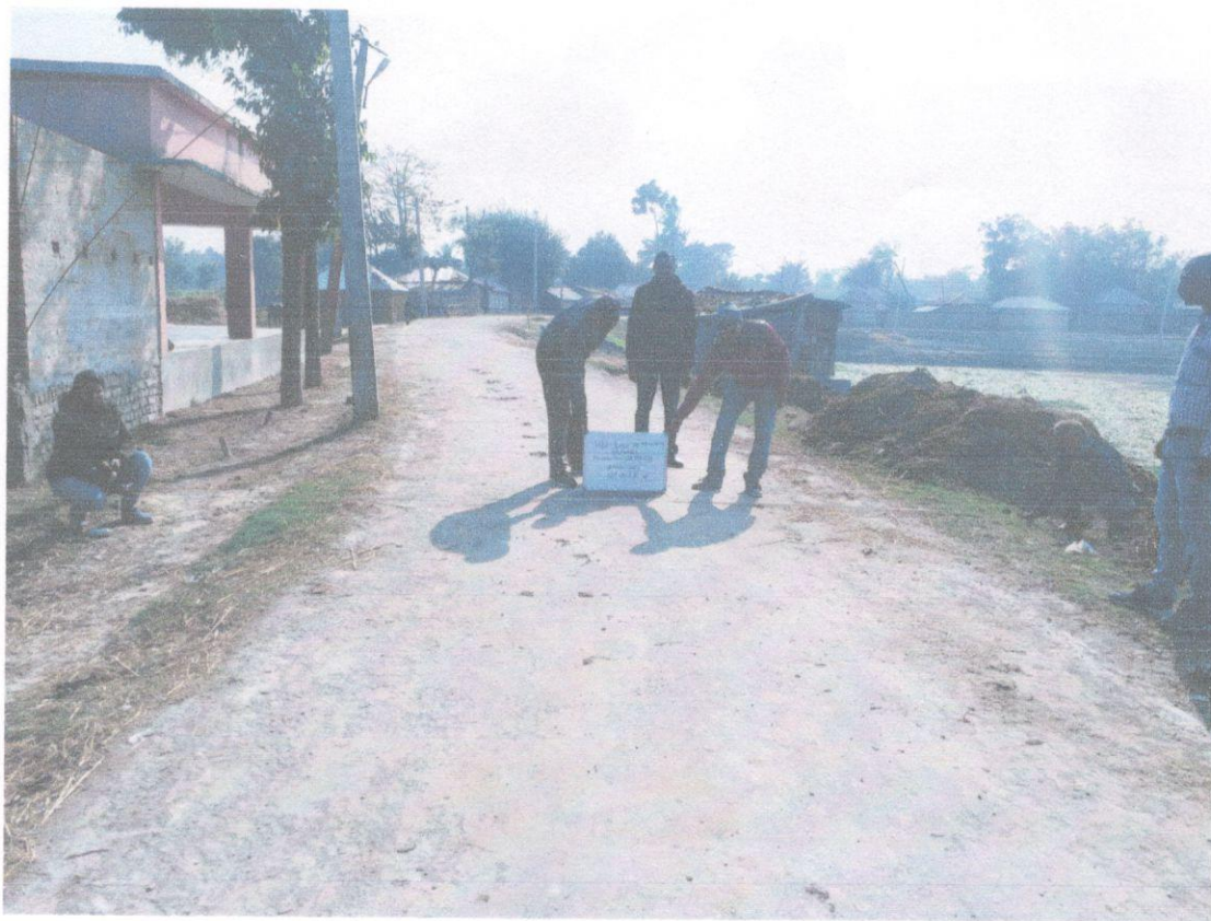
Roadway at KM-/050

Bihar Rural Road Development Agency Project Implement unit PURNIA, Dist- Purnea Name of Road:- L053 TO PRANPATTI TO MUSHARI Block-K. NAGAR PKG- BR27R 428 Length – 0.708KM