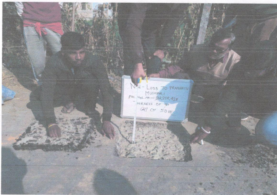
THICKNESS OF B.T AT CH – 0/050 KM