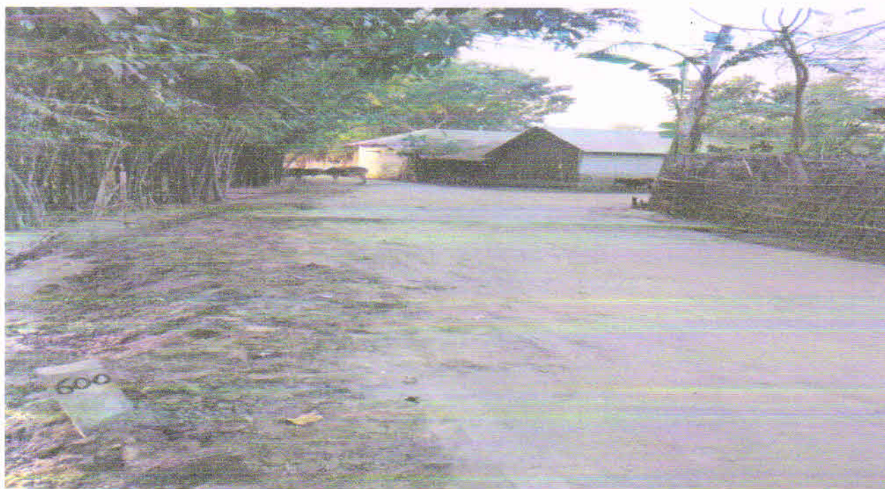
General view showing hectometer stone at Ch: 0.600 KM