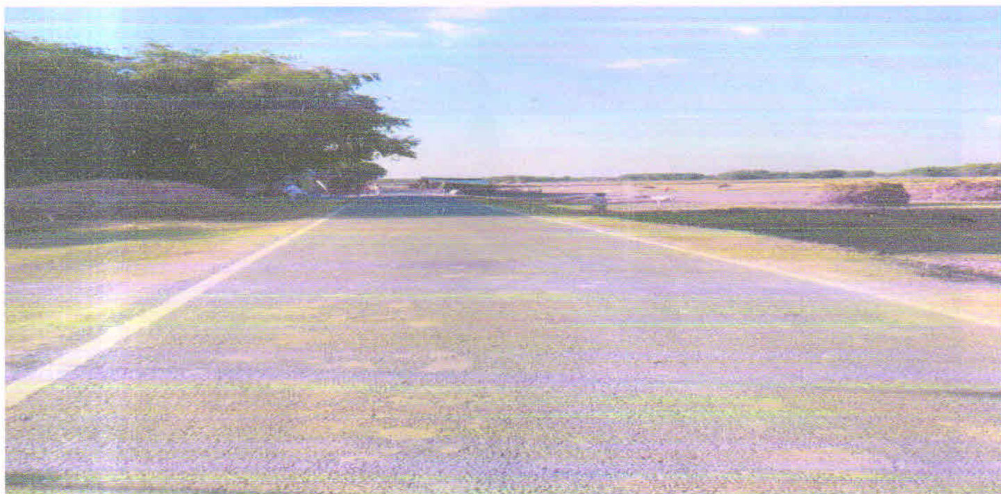
General View of the road At ch 3.500 KM