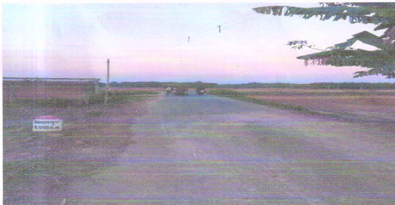
General View of The Road At ch 2.00 KM