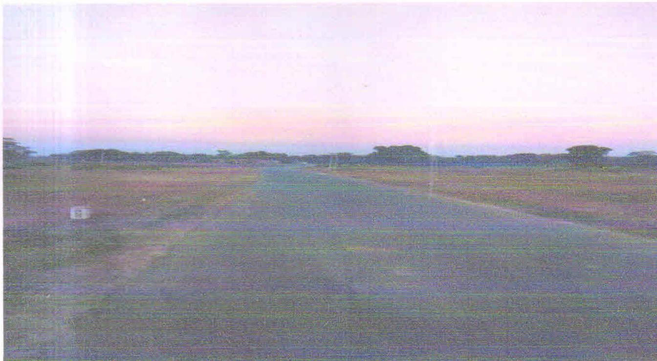
General View of the road at Ch 2.800 KM

Section of Road – L028-T02 to Bishanpur Length – 3.998 KM Road – PMGSY Block – Bahadurganj District – Kishanganj RWD Works Division, Kishanganj-1