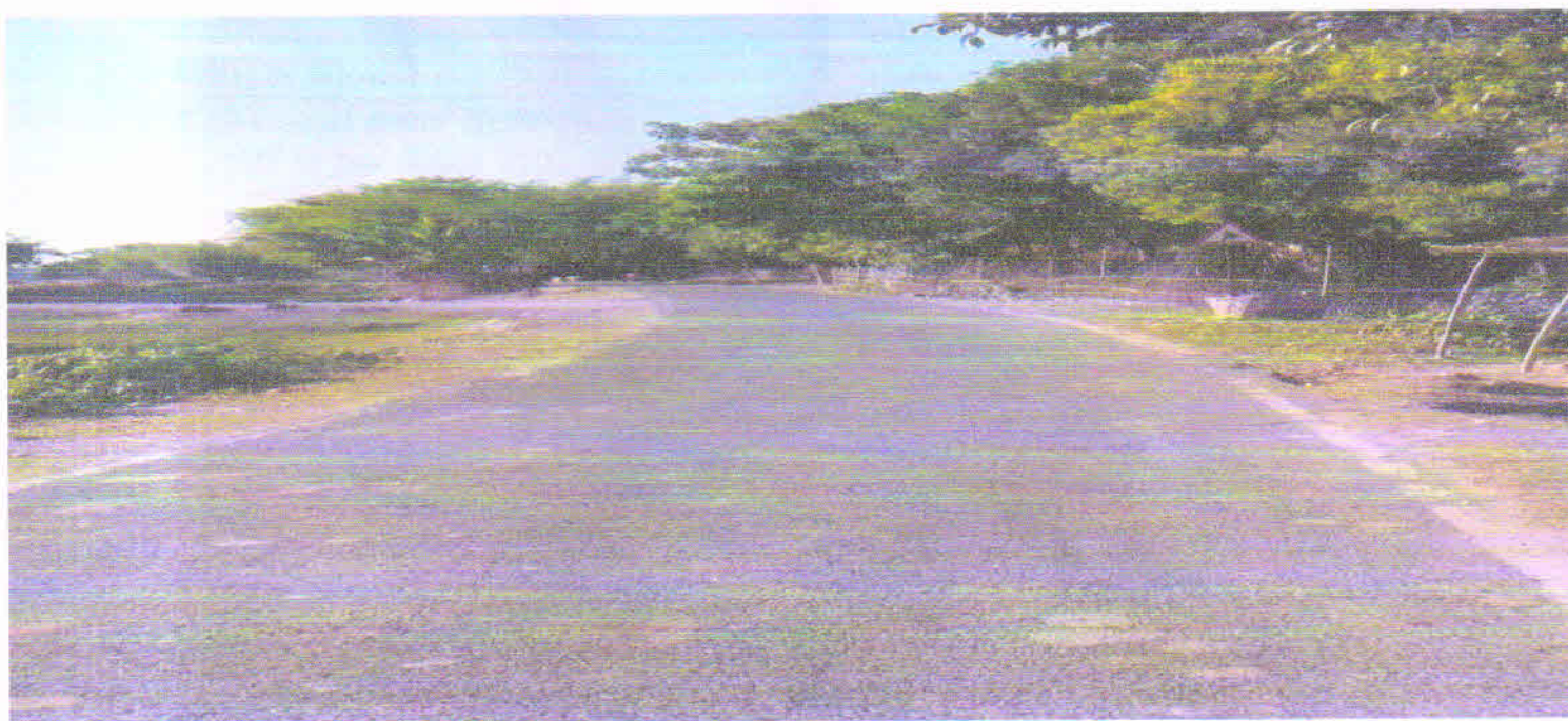
Informatory Board At ch 1.500 KM