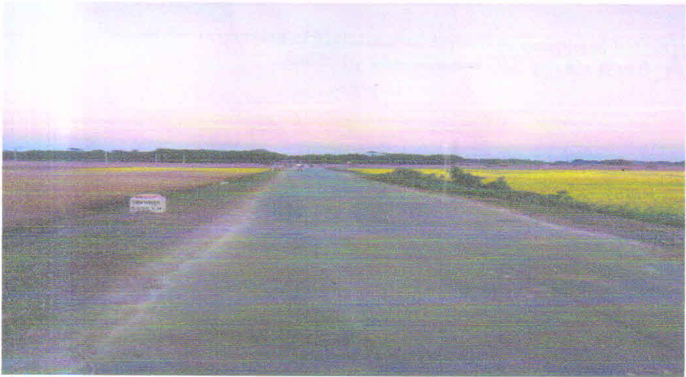
KM Stone and General View of the road At ch 3.000 KM

Section of Road – L028-T02 to Bishanpur Length – 3.998 KM Road – PMGSY Block – Bahadurganj District – Kishanganj RWD Works Division, Kishanganj-1