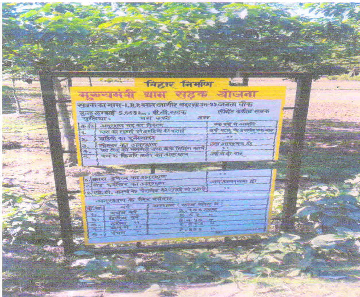
Maintenance Board At Ch: 0.00 KM