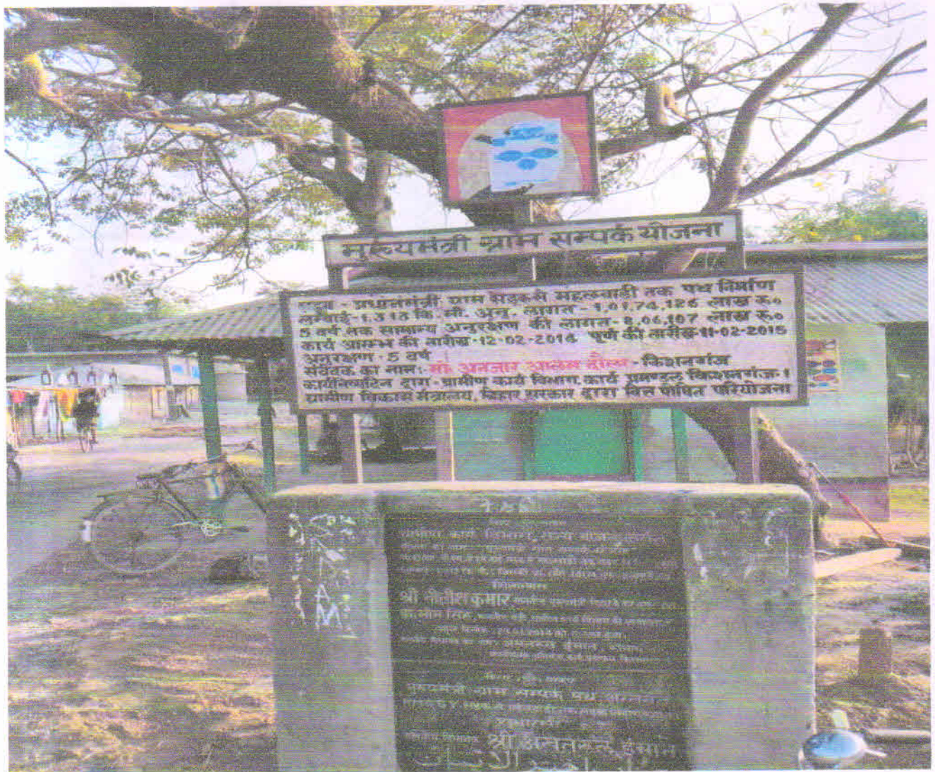
Information Board At Ch: 0.00 KM

Handwritten signature and date: 13/12/18