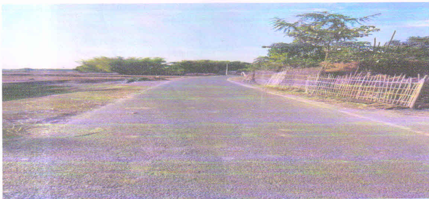
General View of The Road At ch 0.750 KM