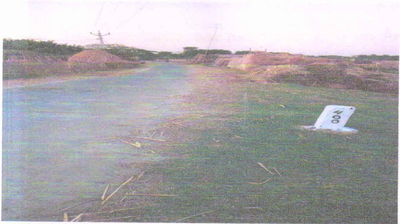
General view & Hectometer post at Ch: 1.800 KM