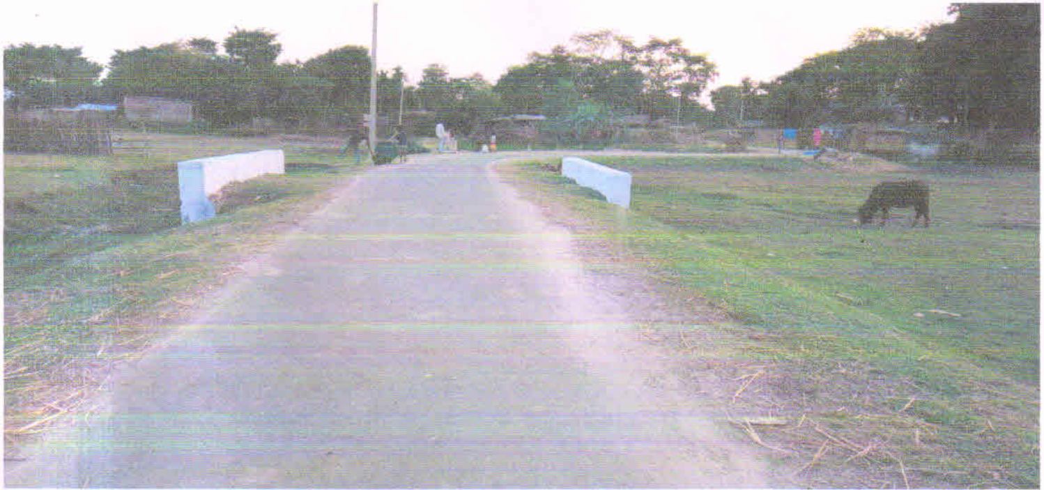
View of CD at Ch: 2.700 KM