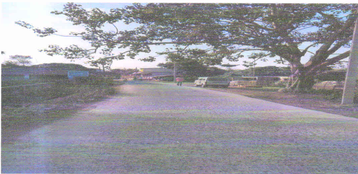
Informatory Board At Ch 4.750 KM