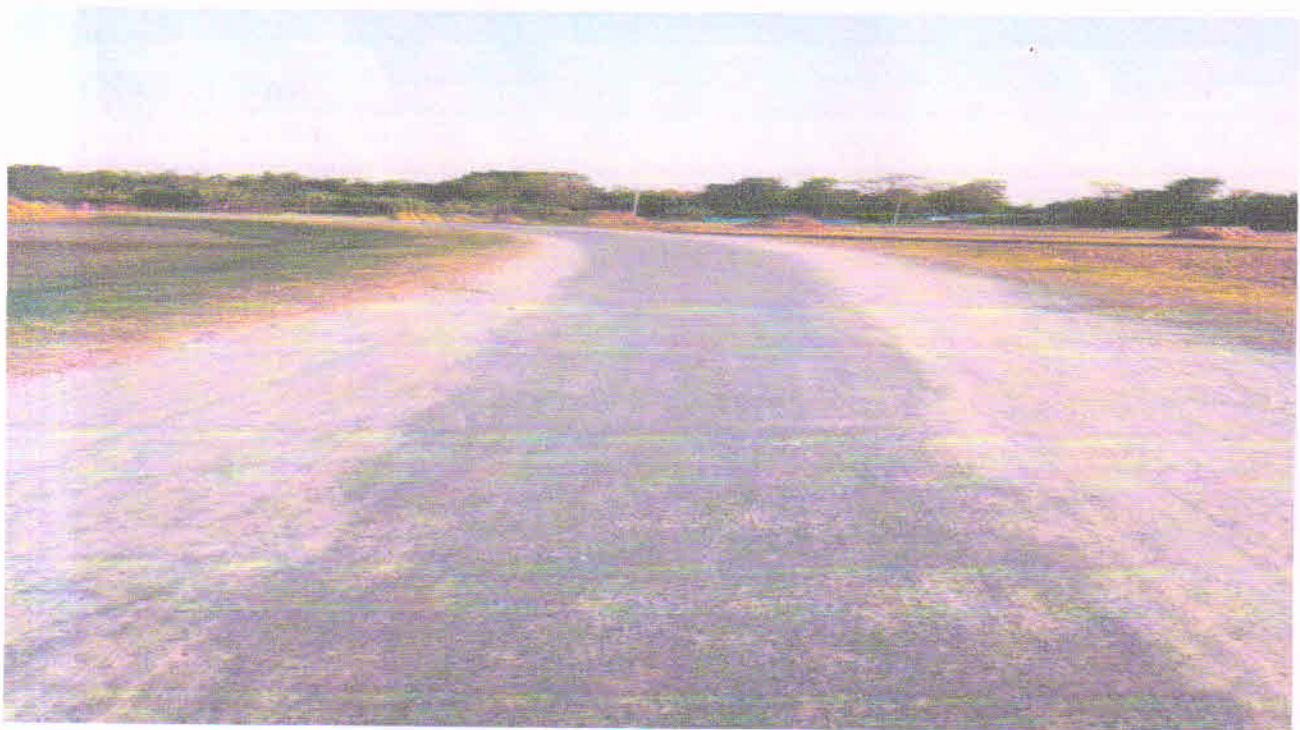
General view at Ch: 0.050 KM