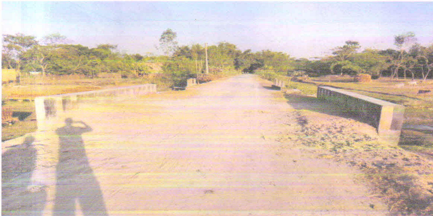
Culvert at Ch: 0.800 KM