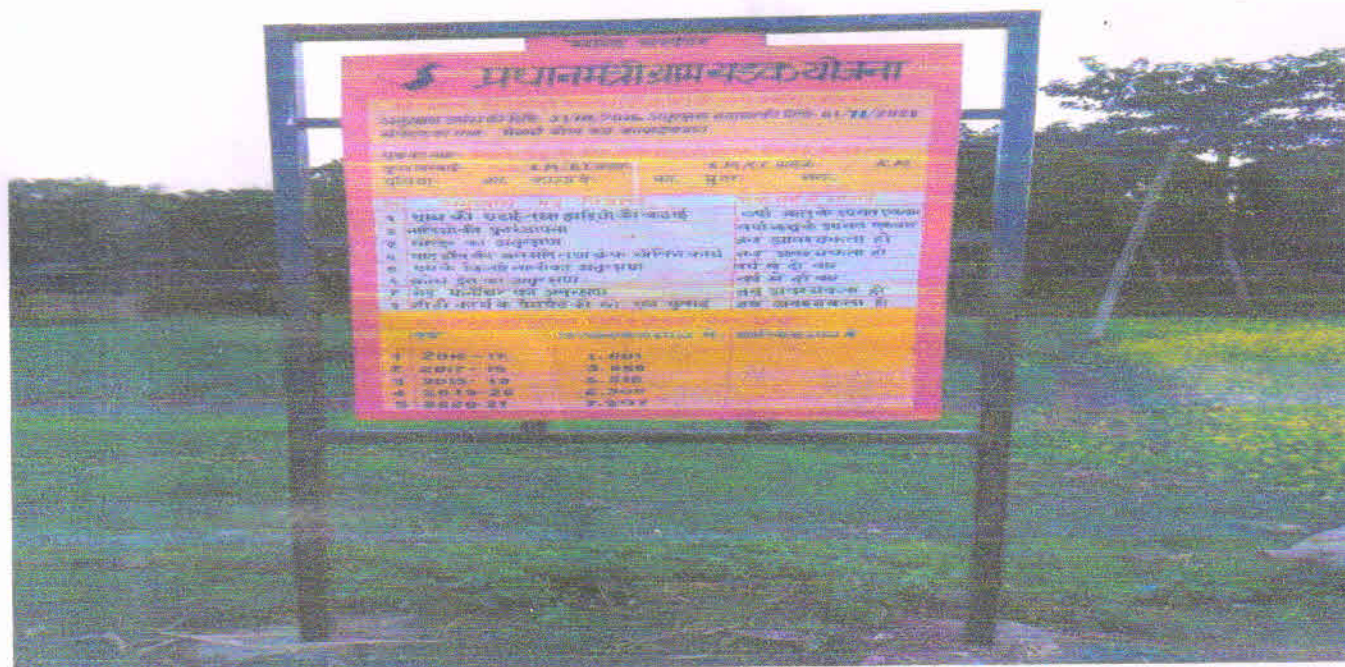
Maintenence board At ch 0.00 KM