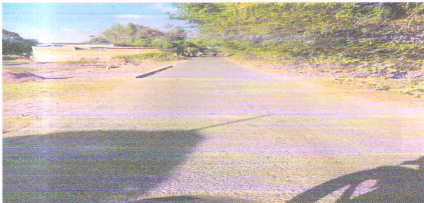
General view of the road At ch 4.100 KM