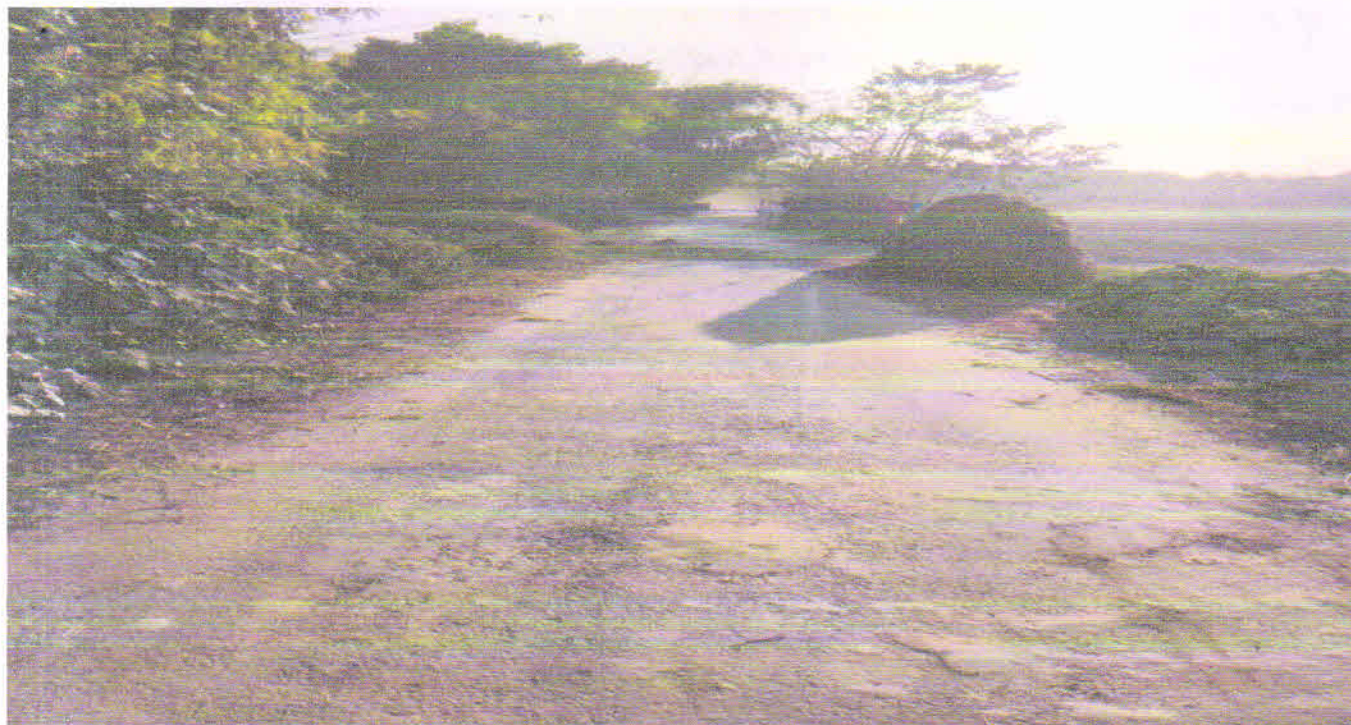
General View at Ch: 0.050 KM