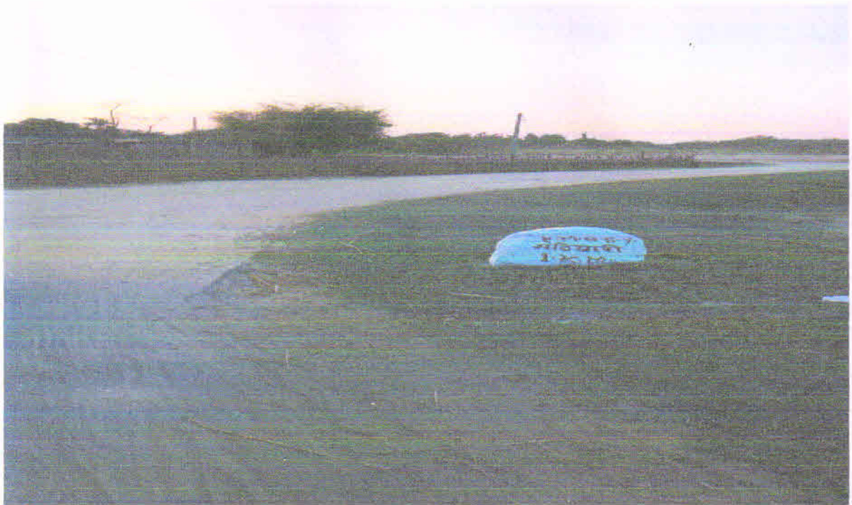
General view & KM Stone at Ch: 1.200 KM

Handwritten signature and date: 13/12/18