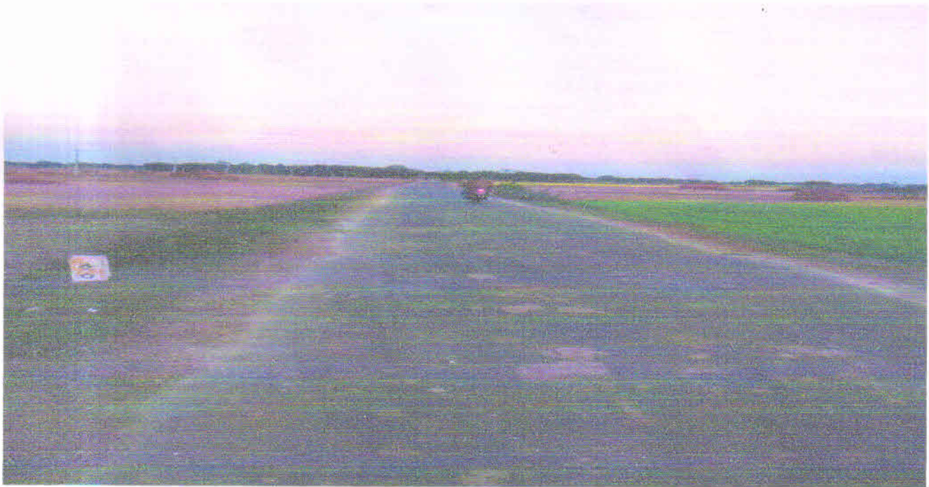
General View of the Road at Ch 1.800 KM