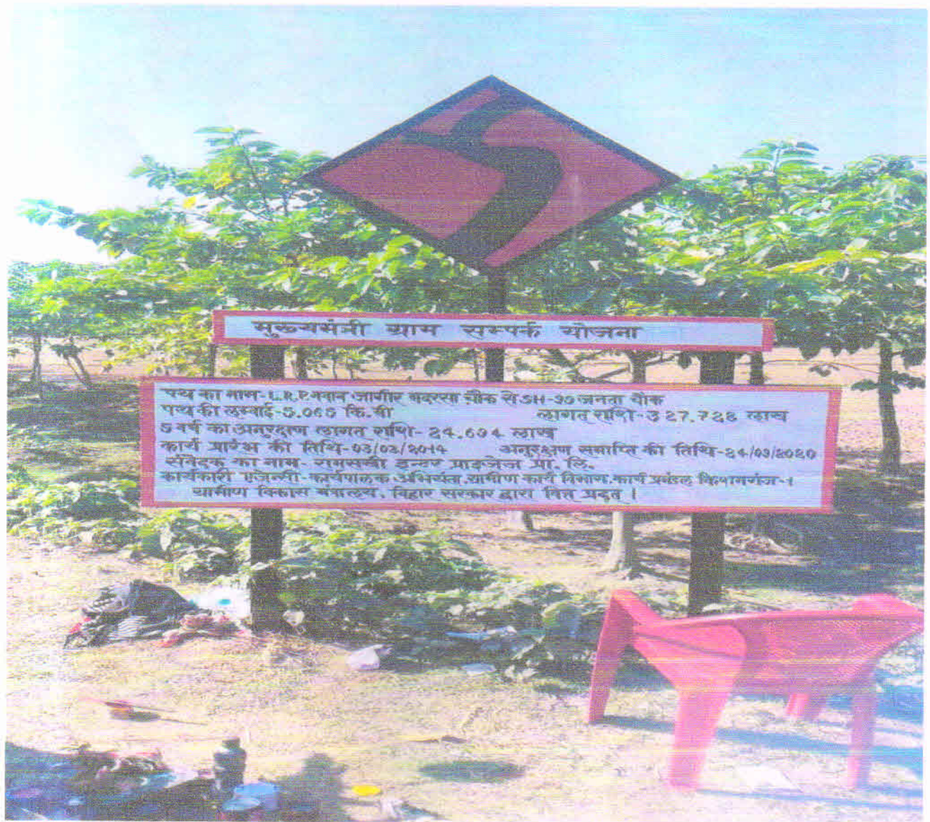
Main Board at Ch 0.00 KM