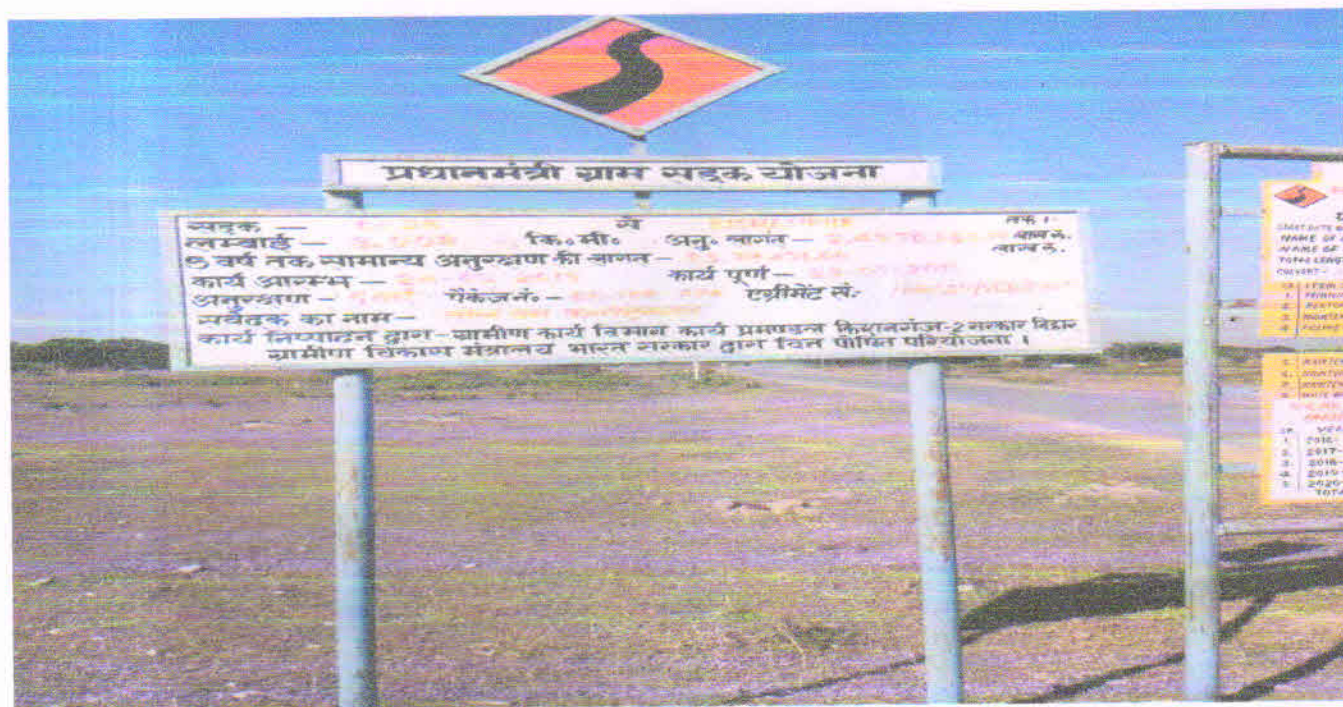
Main information Bord At Ch 0.00 KM

Length – 3.998 KM Block – Bahadurganj District – Kishanganj RWD Works Division, Kishanganj-1