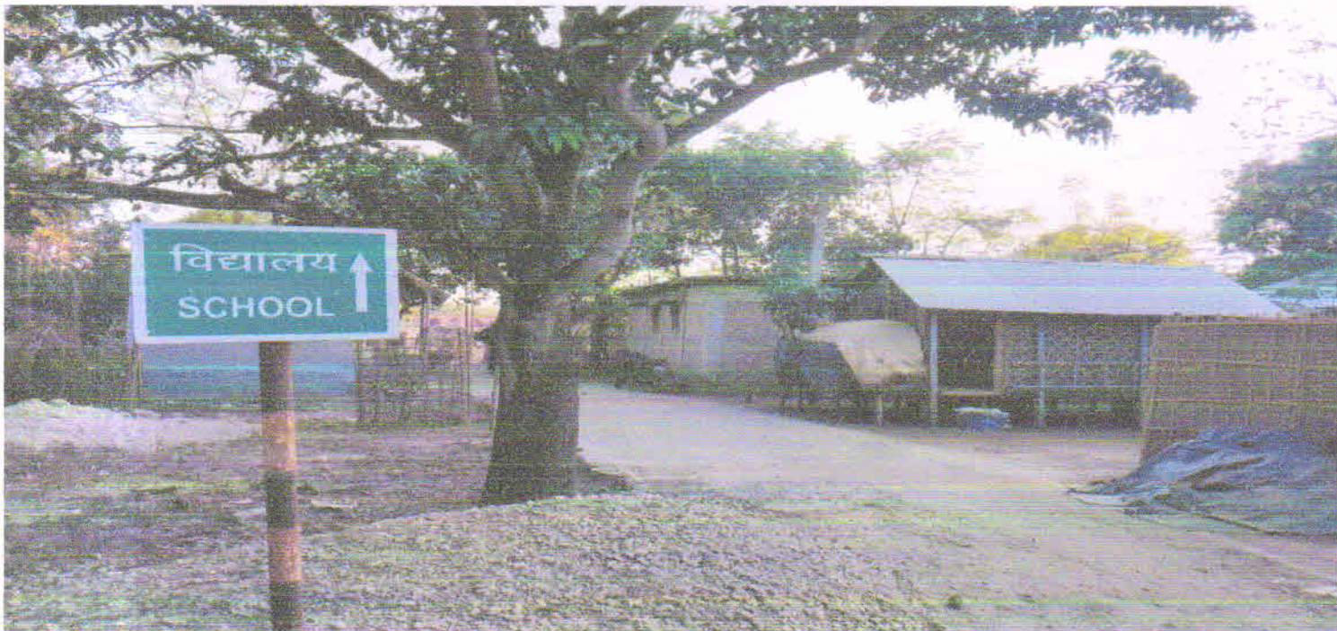
Road signage at Ch:1.150 KM