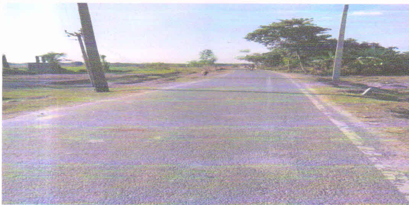
General View of the road Ch 1.800 KM