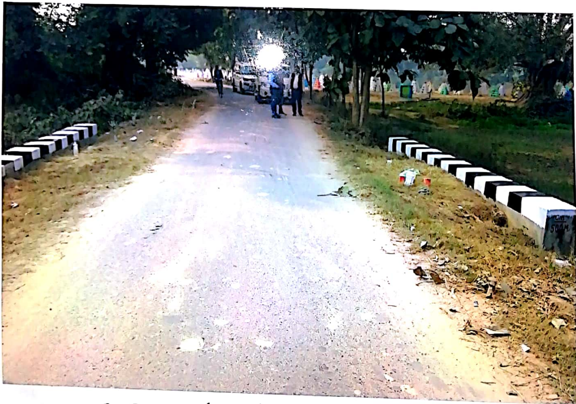
C.D Work at CH- 1950 M