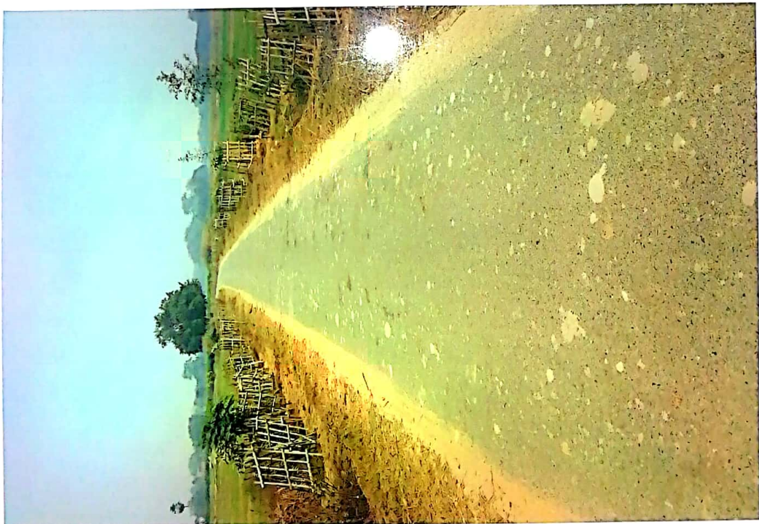
Road Gen View at CH- 2100M