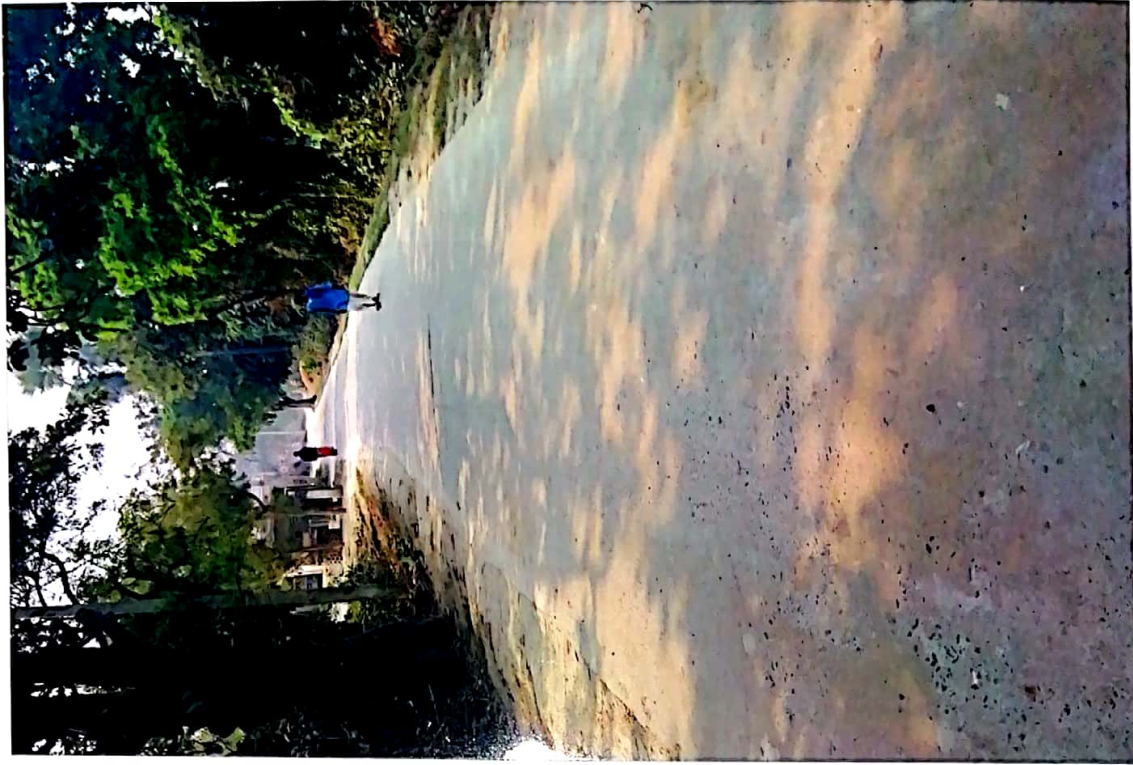
C.C portion at CH- 1800 M