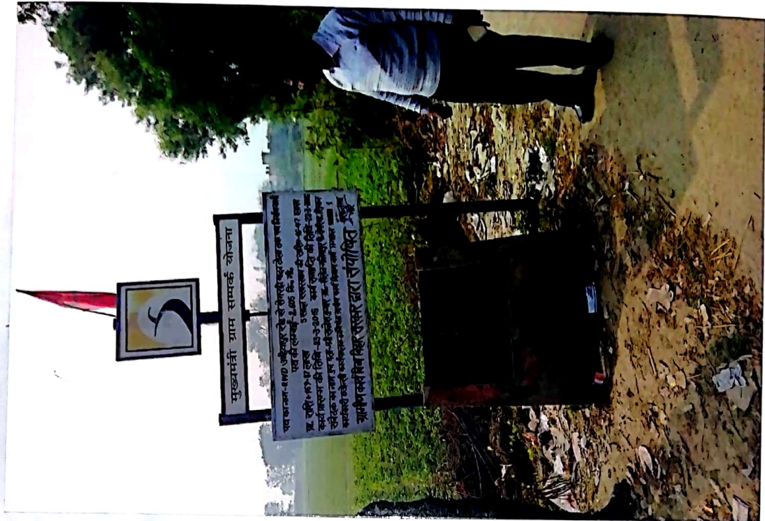
Informationary Sign Board at CH-0.00