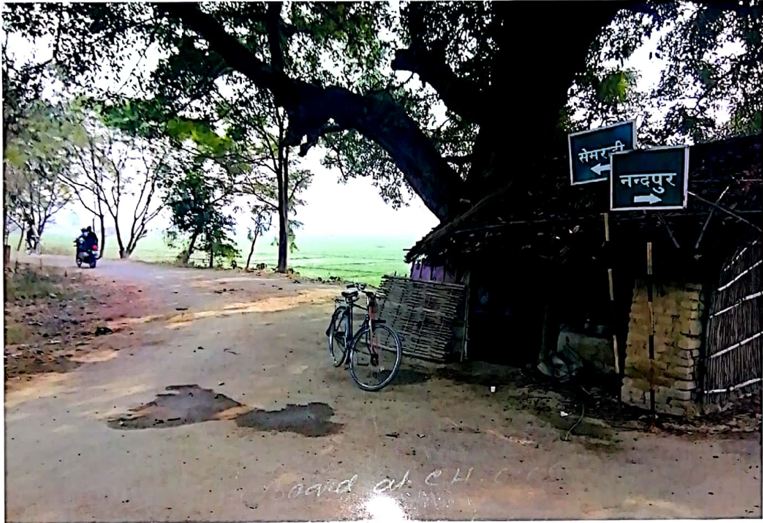
Road Image at CH- 2060M