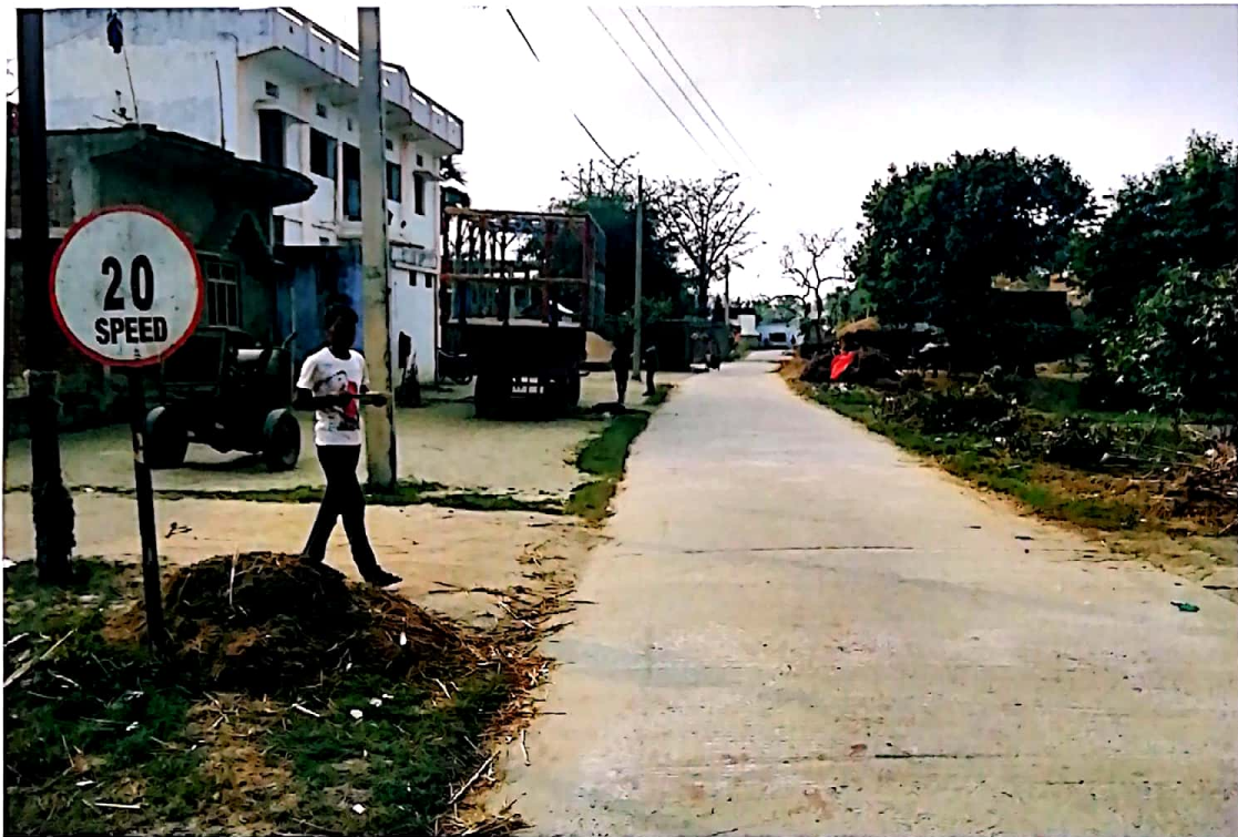
Road Image CH-400M