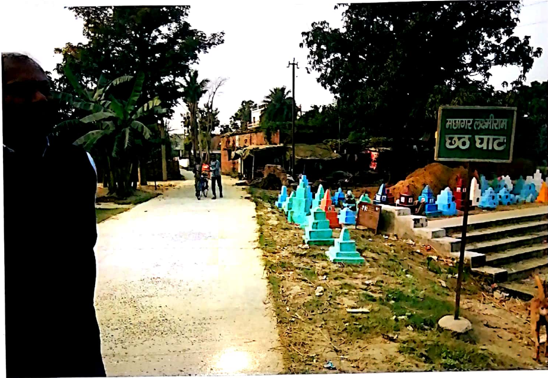
Road Image. CH-500M

पंचायत भवन अद्वार लक्ष्मीराम से पश्चिम ओला