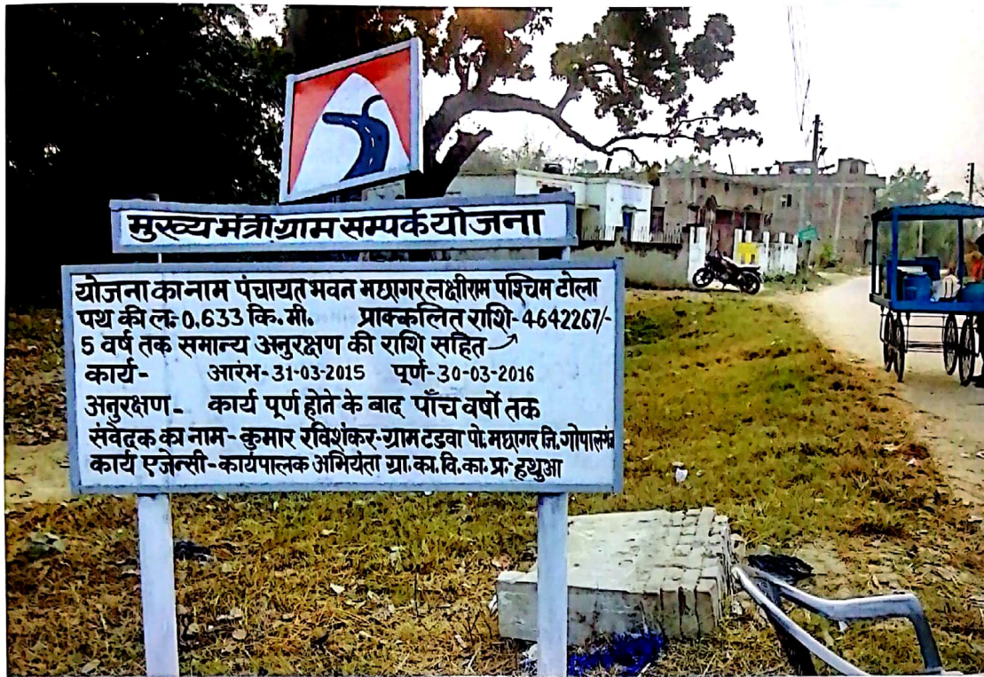
CH- 0.00 Informatory Sign Board.