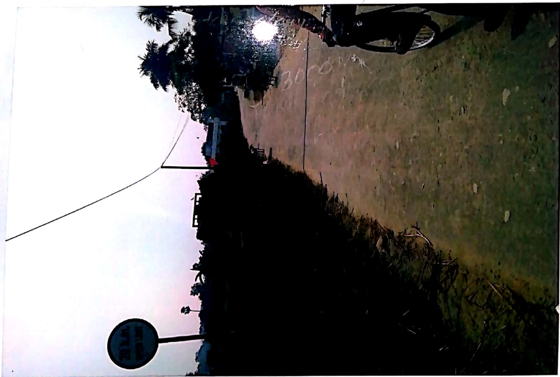
Road Signage at CH-2100M