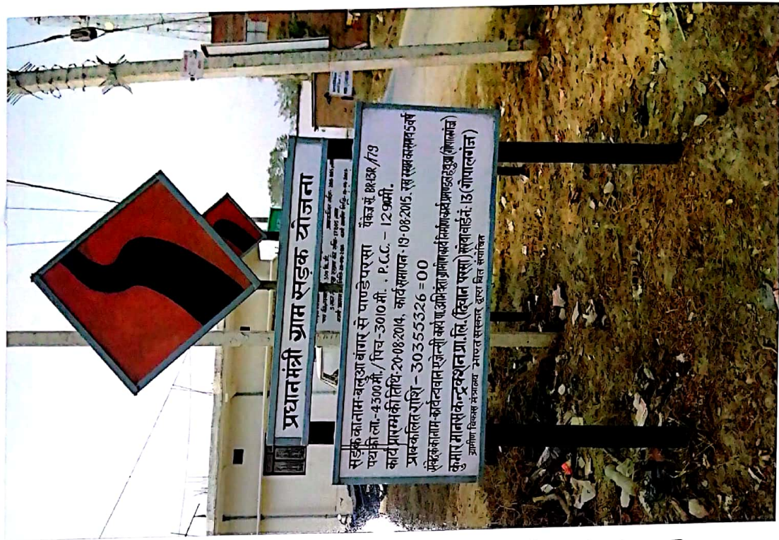
Informationary Sign Board at CH-0.00