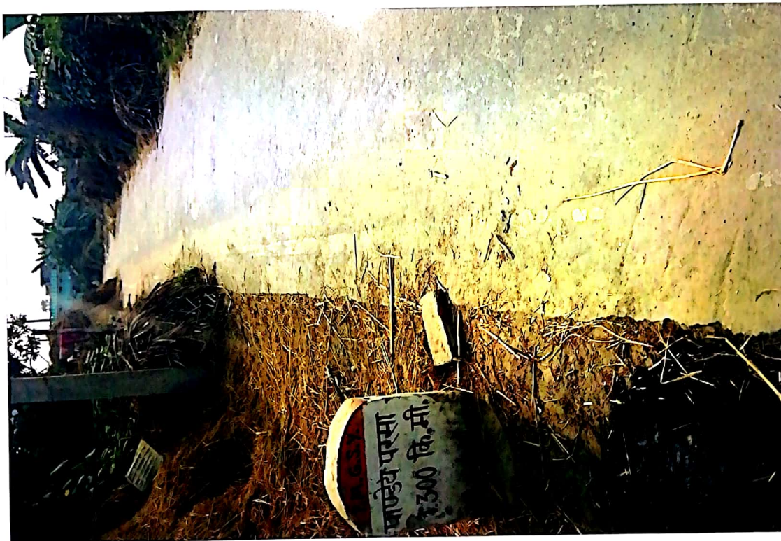
KM post at CH-3000M