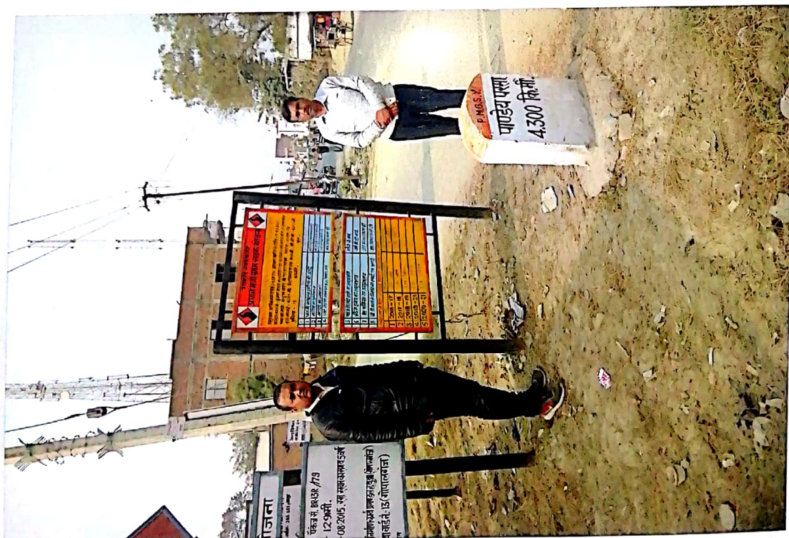
Maintenance board at CH-0.00