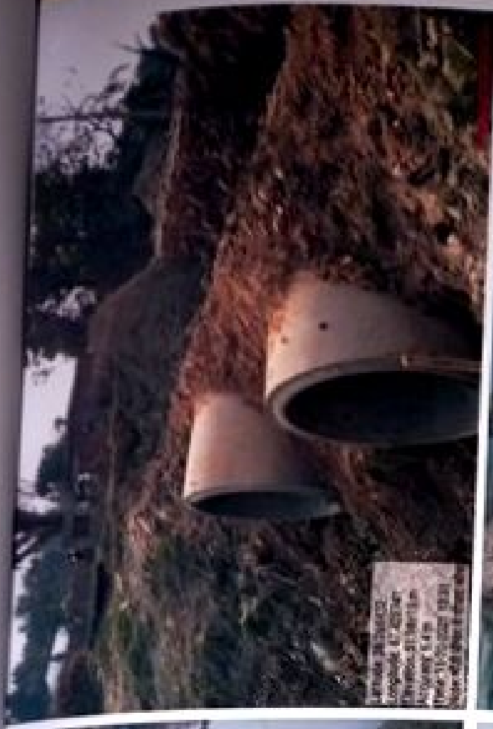
Latitude: 26.2455377 Longitude: 87.4231761 Elevation: 54.79468 m Accuracy: 8.5 m Time: 11-23-2023 16:45 Phone: +91 98421 11234