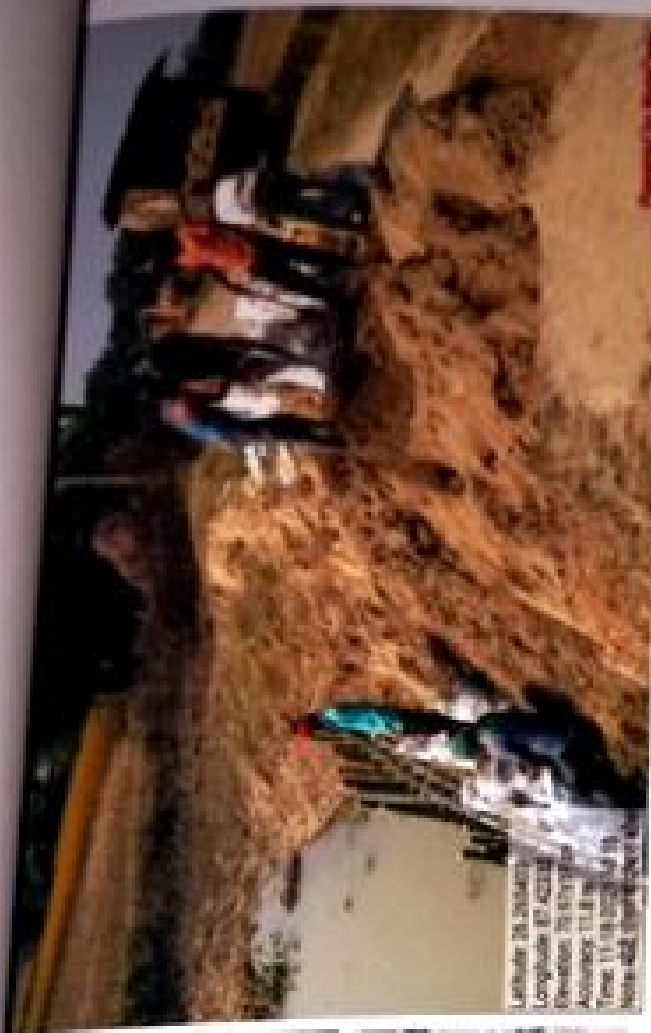
Latitude: 26.261872 Longitude: 87.425594 Elevation: 31.65617 m Accuracy: 8.8 m Time: 11-23-2023 13:49 Note: still report copyright