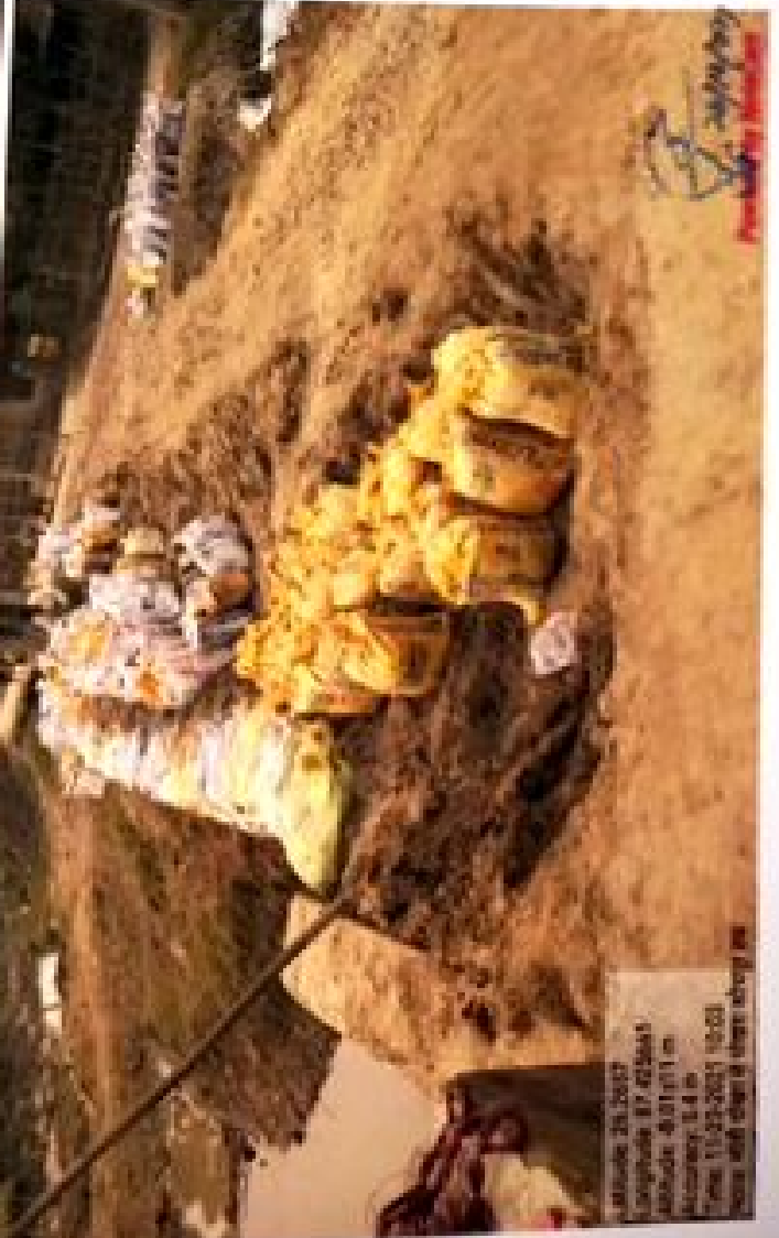
Latitude 26.1265685 Longitude 87.4236697 Elevation at 15.1711 m Accuracy 11.8 m Date 11-23-2021 10:00 Please visit www.gpsinfo.com