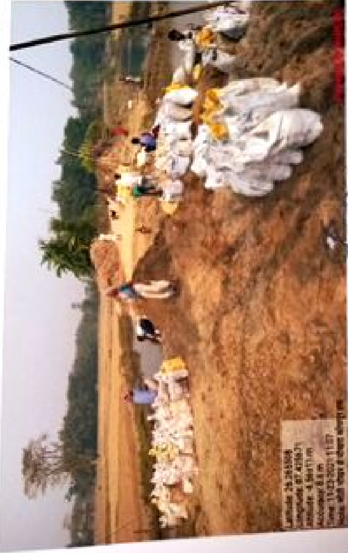
Latitude: 26.261872 Longitude: 87.425594 Elevation: 31.65617 m Accuracy: 8.8 m Time: 11-23-2023 13:57 Note: still report copyright