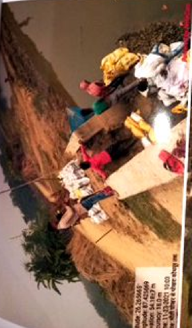
Latitude 26.1265685 Longitude 87.4236697 Elevation at 15.1711 m Accuracy 11.8 m Date 11-23-2021 10:00 Please visit www.gpsinfo.com