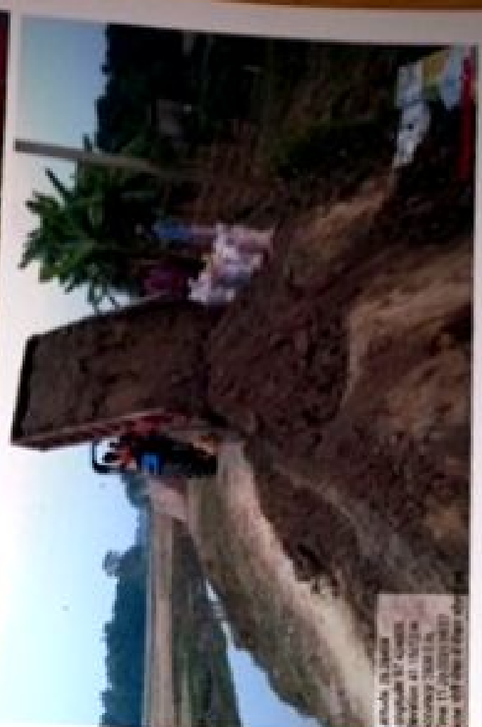
Latitude 26.126818 Longitude 87.4236697 Elevation at 15.1711 m Accuracy 11.8 m Date 11-23-2021 10:00 Please visit www.gpsinfo.com