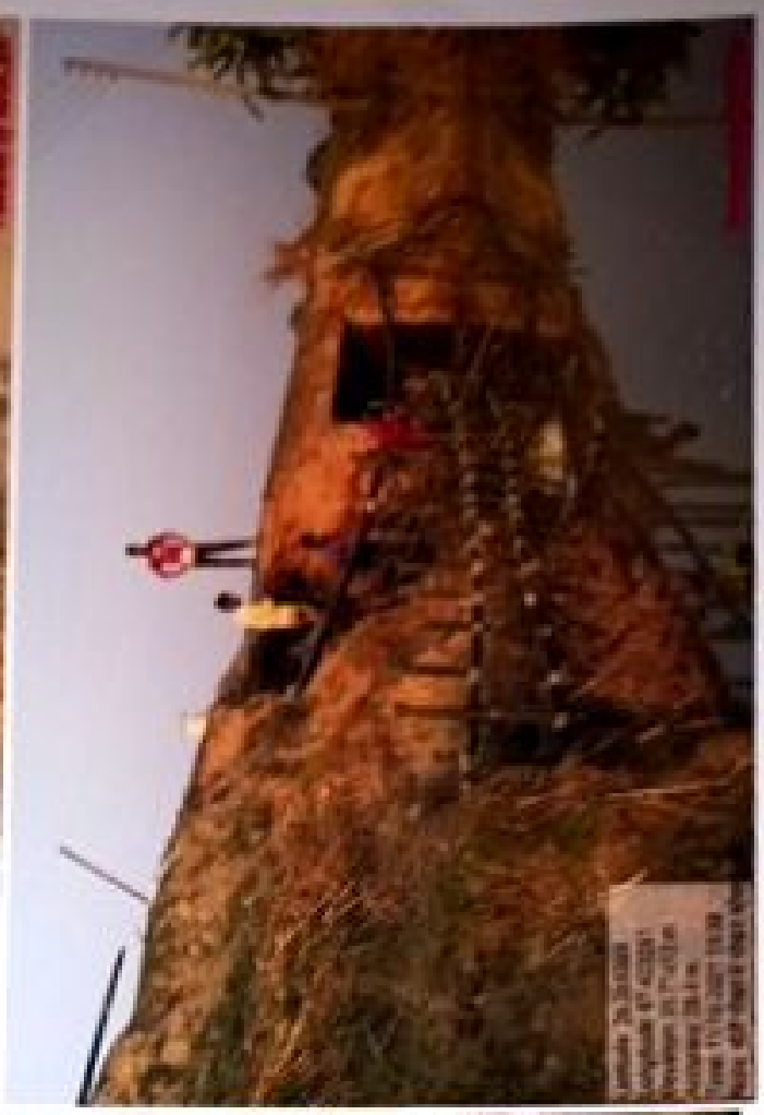
Latitude: 26.261872 Longitude: 87.425594 Elevation: 31.65617 m Accuracy: 8.8 m Time: 11-23-2023 13:58 Note: still report copyright