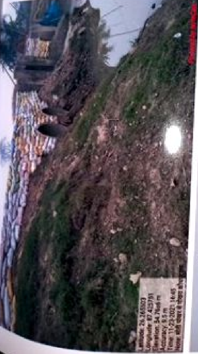
Latitude: 26.2455377 Longitude: 87.4231761 Elevation: 54.79468 m Accuracy: 8.5 m Time: 11-23-2023 16:45 Phone: +91 98421 11234