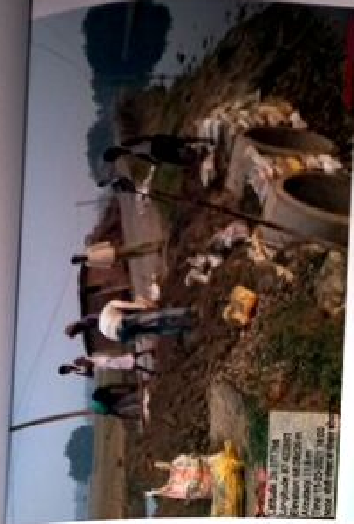
Latitude 26.1271764 Longitude 87.4236697 Elevation at 15.1711 m Accuracy 11.8 m Date 11-23-2021 10:00 Please visit www.gpsinfo.com