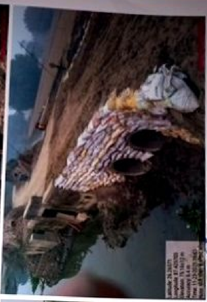
Latitude: 26.2455377 Longitude: 87.4231761 Elevation: 54.79468 m Accuracy: 8.5 m Time: 11-23-2023 16:45 Phone: +91 98421 11234