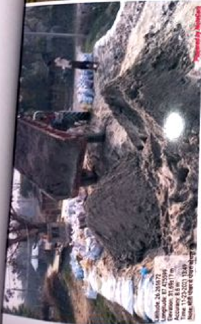
Latitude: 26.261872 Longitude: 87.425594 Elevation: 31.65617 m Accuracy: 8.8 m Time: 11-23-2023 13:48 Note: still report copyright