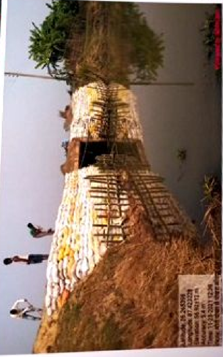
Latitude: 26.2455377 Longitude: 87.4231761 Elevation: 54.79468 m Accuracy: 8.5 m Time: 11-23-2023 16:45 Phone: +91 98421 11234