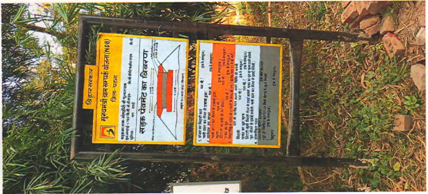
3 Citizen Board

Name - package mmbsy - NDB - BRPP - 189 - PALIHANJ Selhauri to bulalchak Length of Road - 1.750 km. Block - Dulhin Bazar Dist - Patna